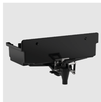
Self Service Supreme Tray